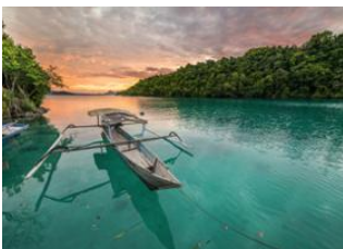
Togian islands 📍