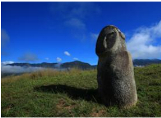
Bada Valley 📍