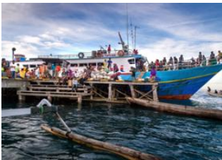
Ampana 📍 - ⌚ 4h Togian islands 📍