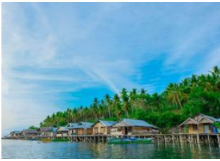
Bada Valley 📍 - ⌚ 5h Tentena 📍 🚗 - ⌚ 4h Ampana 📍