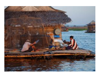
Rantepao 🛛 🖨 210km - 🕑 5h Sengkang 9