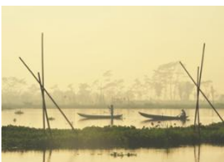
Ambarawa 📍 🚗 - ⌚ 1h 30m