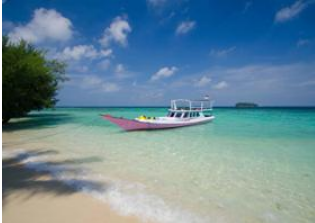
Semarang 📍 🚢 - ⌚ 2h Karimunjawa 📍