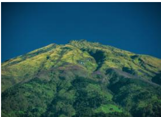
Bandongan 📍 🚗 - ⌚ 1h 30m Ambarawa 📍