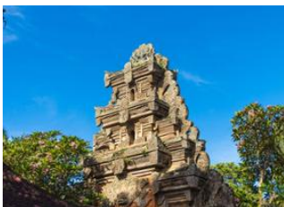
Denpasar airport 📍 🚗 40km - ⌚ 1h 20m Ubud 📍