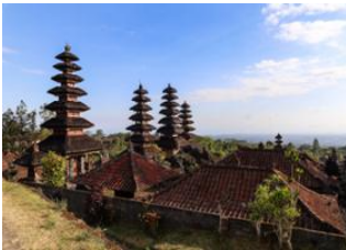
Ubud 📍 🚗 - ⌚ 1h Kehen Temple 📍 🚗 - ⌚ 1h 30m Sidemen 📍