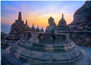
Borobudur Temple 📍 🚗 - ⌚ 45m Bandongan 📍