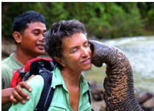
Tangkahan 📍 🚗 - ⌚ 3h 30m Bukit Lawang 📍