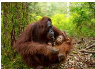
Bukit Lawang 📍 - ⌚ 5h Mt Leuser 📍