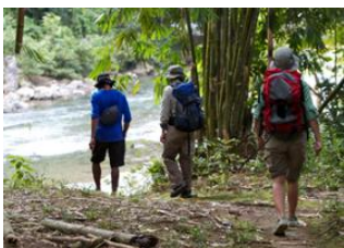
Mt Leuser 📍 - ⌚ 4h Bukit Lawang 📍