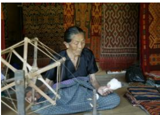
Rantepao 📍 🚗 210km - ⌚ 5h Sengkang 📍