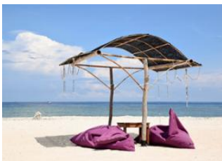
Gili Air 📍