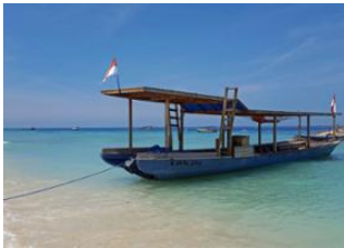
Sidemen 📍 🚗 27km - ⌚ 1h Padangbai 📍 Gili Air 📍