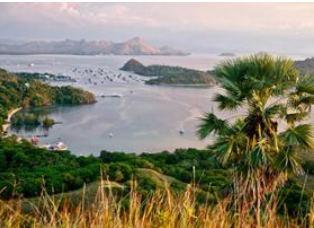
Labuan Bajo 📍