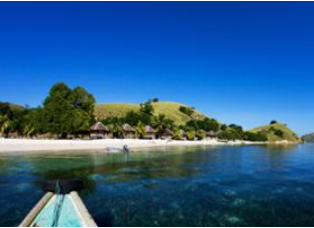
Labuan Bajo 📍 Seraya Island 📍