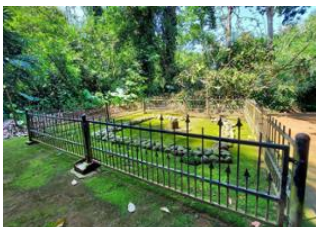
Galunggung volcano 📍 🚗 - ⌚ 4h Baturaden 📍