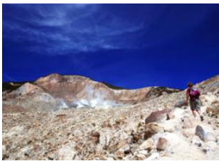
Malabar Tea Plantations 📍 Mt Papandayan 📍