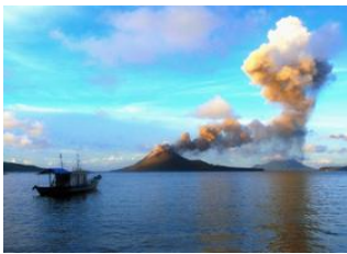
📍 🏠 - ⌚ 2h Krakatoa 📍