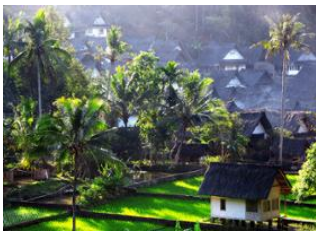
Mt Papandayan 📍 🚗 - ⌚ 2h Kampung Naga 📍 🚗 - ⌚ 30m Galunggung volcano 📍