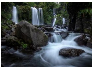
Baturaden 📍 🚗 - ⌚ 3h Wonosobo 📍