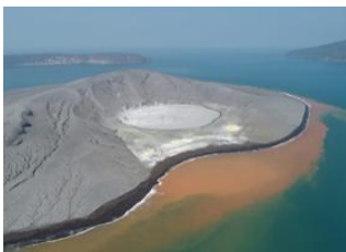
Krakatoa 📍 - ⌚ 2h 30m Ujung Kulon NP 📍 Peucang Island 📍