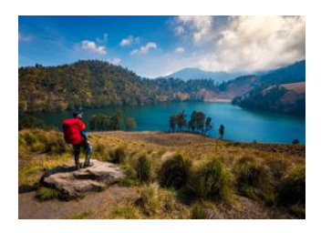
Tumpang ♥ ♣ 30km - ④ 2h Ranupani ♥ 14km - ④ 5h 30m Kalimati ♥